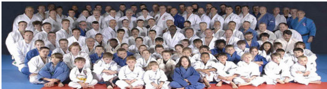
Some of our 300+ previous campers

Improve Your Judo, Japanese JJ & Brazilian JJ Skills June 20-22, 2024