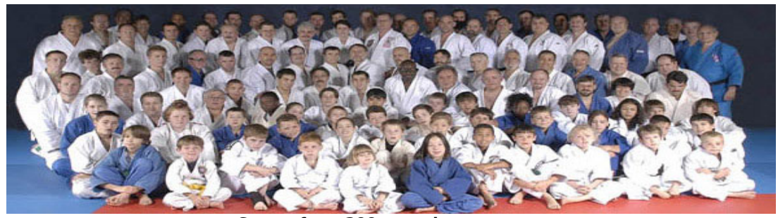
Some of our 300+ previous campers

Improve Your Judo, Japanese JJ & Brazilian JJ Skills June 20-22, 2024