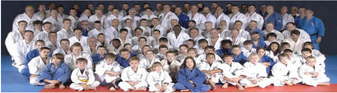
Some of our 300+ campers from 2009