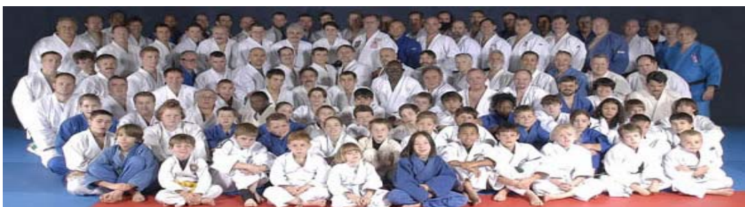
Some of our 300+ campers from 2009